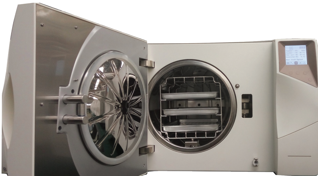
Sterilizer with open door