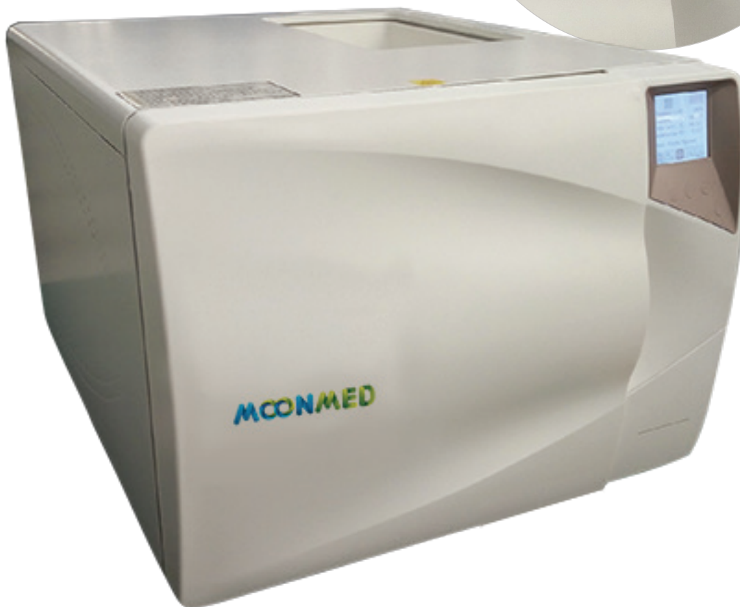
TABLE TOP STERILIZER SERIES S CLASS MODEL : MO-MOST-T24/45/80