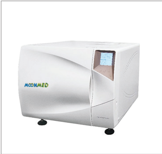
MODELS: MO-MOST-T 24/45

Three standard model sizes : 24L, 45L, 80L