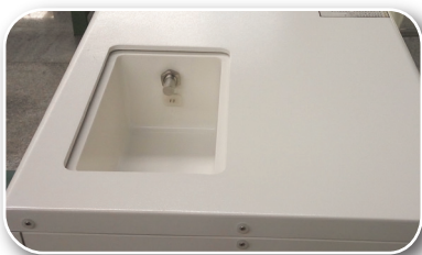
Easy access to water tank-no more bio-burden or Algae